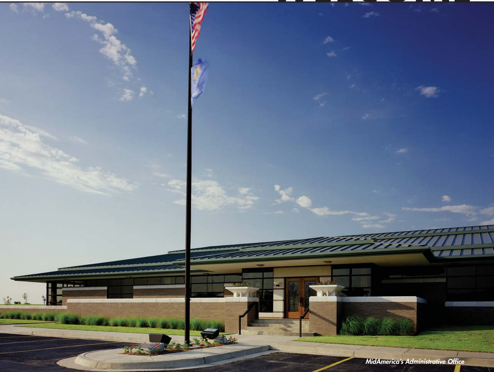
MidAmerica's Administrative Office

MIDAMERICA INDUSTRIAL PARK IS CONVENIENTLY LOCATED between Pryor Creek and Chouteau in ----- northeast Oklahoma, just 40 minutes east of Tulsa. The park is owned and operated by a self-sustaining public ----- trust charged with creating jobs throughout the region.