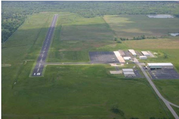
Our Regional Business Airport (RBA) features a 5,000-foot runway for most business jets and a 365-acre airpark available for aviation related firms.

From any angle, MidAmerica Industrial Park is a great place to operate a manufacturing plant or distribution center. We are the largest industrial park in Oklahoma and home to divisions of some of the world's largest companies. The park is managed by a public trust that administers all services from