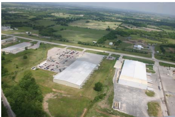
Many of our largest employers and our Administrative Office are located on Highway 69A. From left to right: Mid-South Maintenance, One American Way and SYGMA.