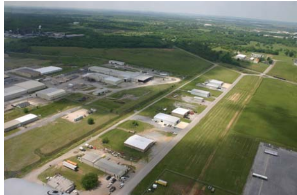
Nearly 80 companies have facilities at MidAmerica including seven "Fortune" and eight "Global 500" divisions.

marketing and water / wastewater treatment to airport operations and preventive maintenance of all major park assets. Our infrastructure and advantages provide our industries with the support they demand to compete and prosper globally. Welcome to MidAmerica.