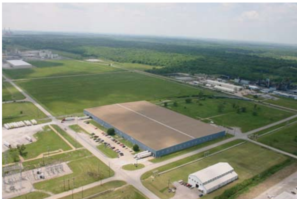
The park has many "Greenfield" sites available for built-to-suit plant or distribution center facilities.