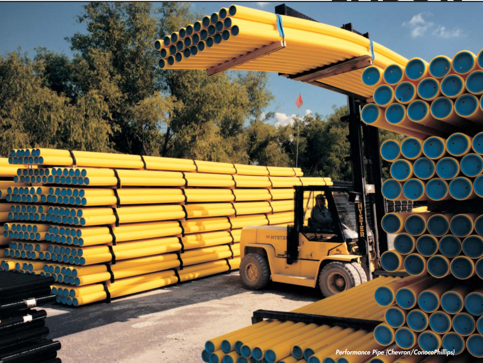
Performance Pipe (Chevron/ConocoPhillips)

THE WORKFORCE AT MIDAMERICA IS KNOWN FOR HIGH-PRODUCTIVITY AND RELIABILITY.